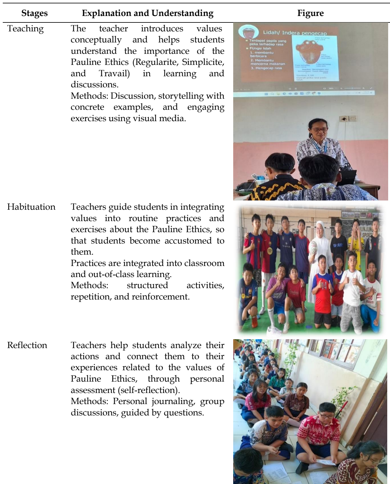
Table 2. Pauline ethics internalization cycle

recurring cycle that gradually transforms moral values into personal character and collective school culture.